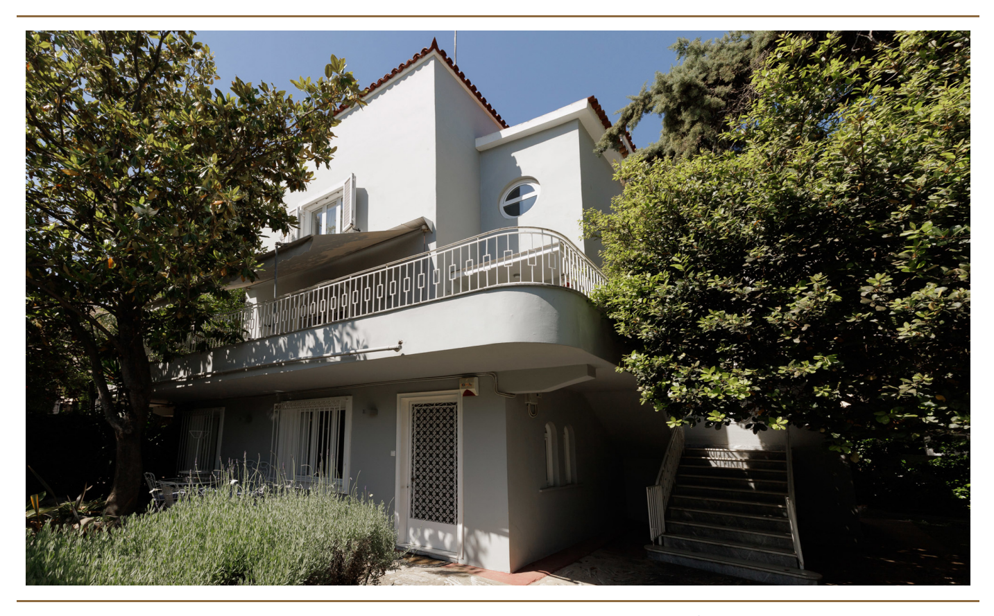
PURCHASE PRICE: 4.500 EUR \, \bullet \, LAND AREA: 600 m^2